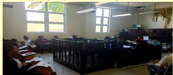
Members of the Legal Aid Council and members of the St. Catherine Court Staff who participated in the St. Catherine, Just in Time Training.