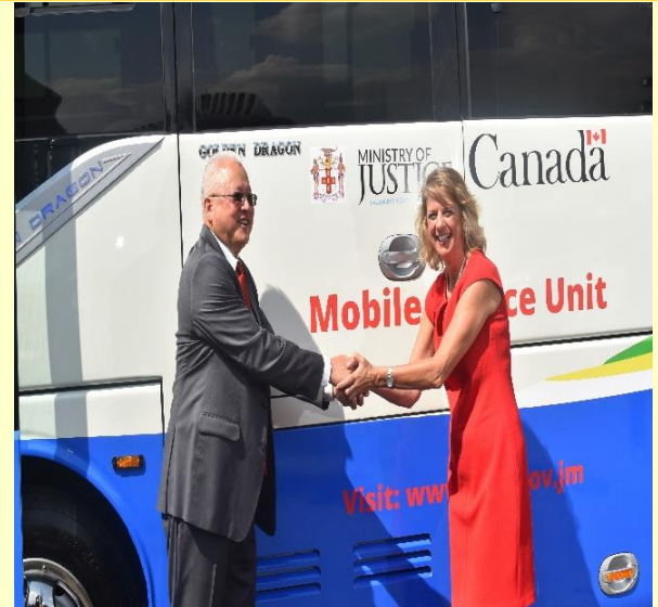
Minister of Justice, Hon. Delroy Chuck with Canadian High Commissioner to Jamaica, Her Excellency Laurie Peters.

The Units will expand the reach of the Legal Aid Council, and build on the work of the current MJU, which served approximately 100 communities during the 2018/2019 Fiscal Year. The MJUs will help to bridge the accessibility gap to Justice Services. Consequently, more persons will be able to consult with an Attorney-at-Law and assignments of Attorneys in criminal matters will be done without persons having to go to the offices of the Legal Aid Council. The Justice Centres islandwide will be venues for scheduled MJUs visits.