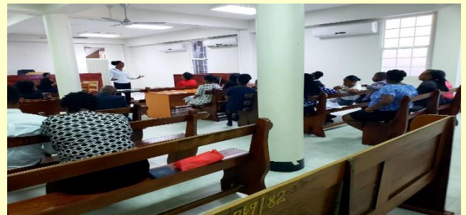
Members of the Legal Aid Council and members of the St. Mary Parish Court Staff who participated in the St. Mary, Just in Time Training.