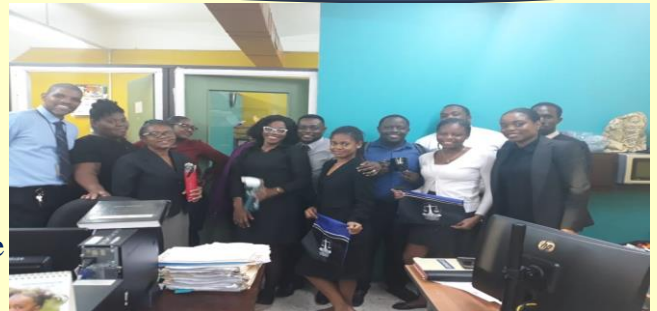
Members of the Legal Aid Council and members of the Supreme Court Staff who participated in the Just in Time Training.

Additionally, our stakeholders are reminded that the Duty Counsel services offered by the council are free, and that for court assignments there is no mandatory fee. A means test will be done to determine if a contribution is payable by our clients for court matters and if yes, the client will be asked to pay the agreed amount, at any Scotiabank. The Legal Aid Council through this initiative wants to ensure access to First Class Justice for all.