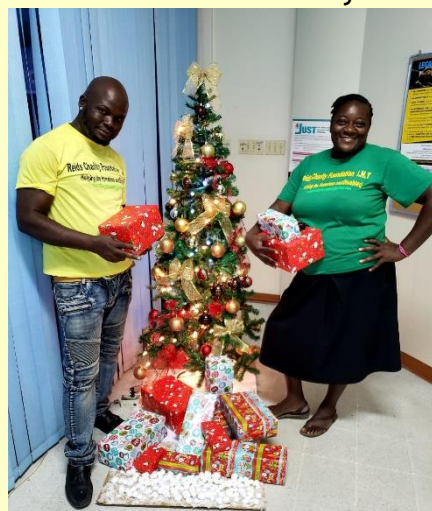
Customers of the Legal Aid Council

Christmas is a time of love and good cheer as Christmas comes but once a year. This year the Legal Aid Council shared gifts from under its Christmas tree with Attorneys and clients.