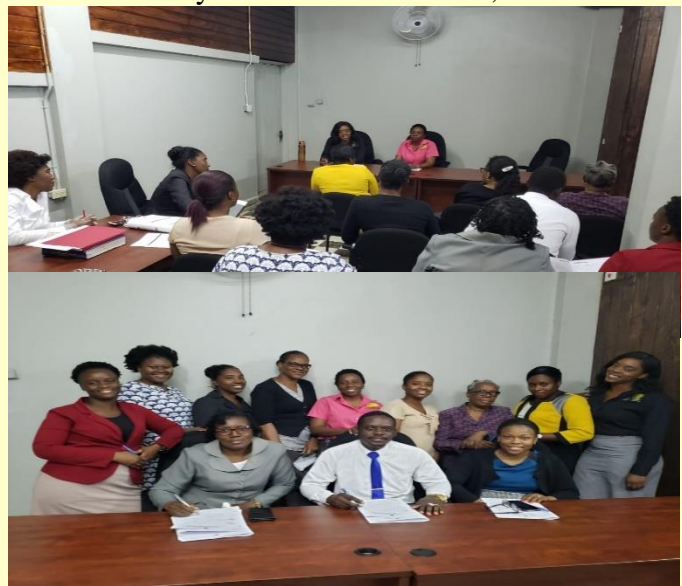
Members of the Legal Aid Council and members of the Clarendon Parish Court Staff who participated in the Clarendon, Just in Time Training.

Additionally, our stakeholders are reminded that the Duty Counsel services are free, and that for court assignments there is no mandatory fee. A means test will determine if a contribution is payable by our clients for court matters and if yes, the client will be asked to pay an agreed amount. The Legal Aid Council through this initiative wants to ensure access to first class justice for all.